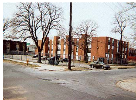
MADISON GARDENS APARTMENTS BEFORE BROWNFIELD CLEANUP

The Brownfield program is constantly growing; increasing the number of properties certified each year. With a limited amount of funding available each year the need for additional funding sources is wanted. To help facilitate the financial burden developers and non profit organizations face when cleaning up a contaminated site the Brownfield Revolving Loan Fund (BRLF) was implemented.