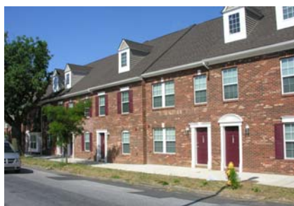
MADISON GARDEN APARTMENTS AFTER BROWNFIELD CLEANUP

In fall 2006, Delaware Department of Natural Resources and Environmental Control, Site Investigation and Restoration Branch (DNREC-SIRB) was granted $1.25 million by the EPA to capitalize the Brownfield Revolving Loan Fund.